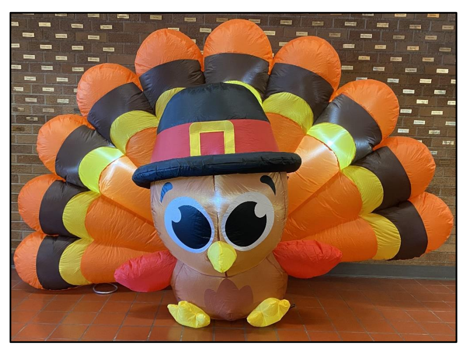
Keeping the entry festive with this cute turkey!

The school messaging system has been updated for this school year and a trial run will be made